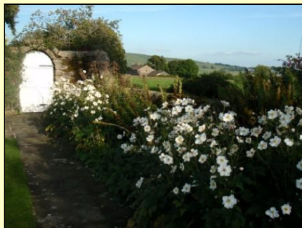
'Flowering Garden' by Lyn & Pete Couling